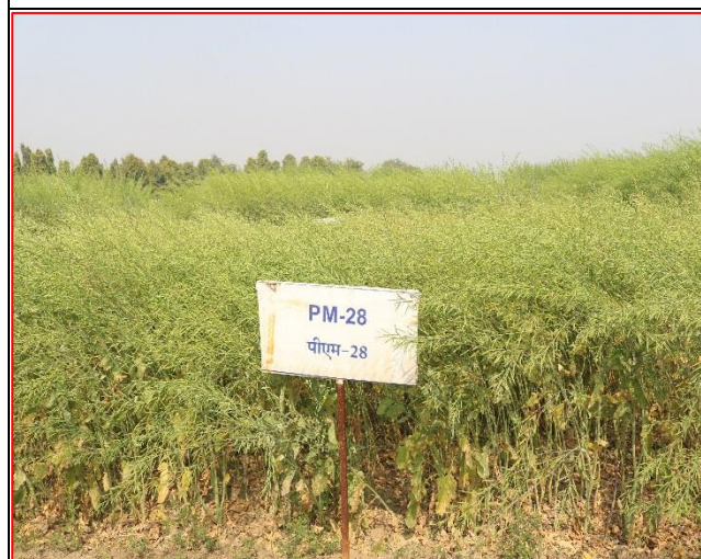
Pusa Mustard 28