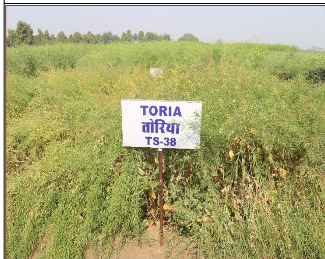
TS - 38 (Torja)